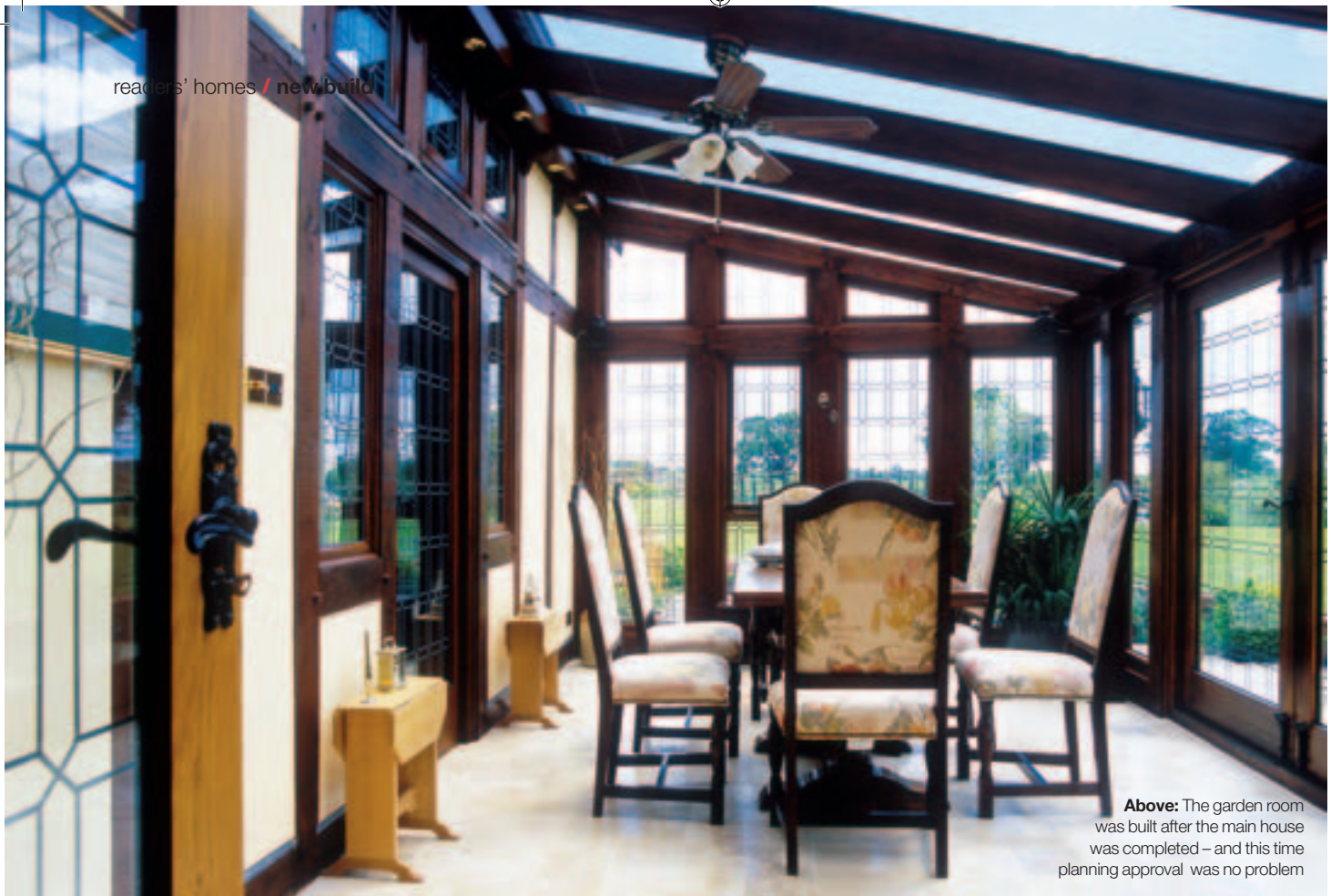
Above: The garden room was built after the main house was completed – and this time planning approval was no problem